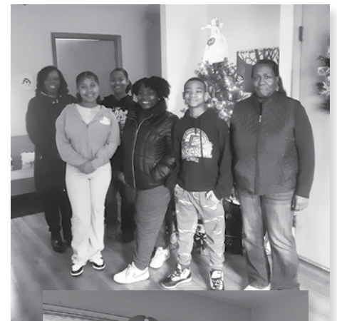
Mt. Zion Missionary Baptist Church of Waukegan donated holiday gift bags.