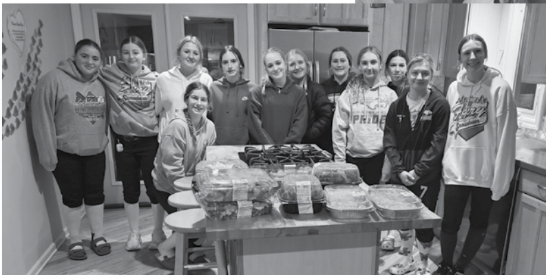
Grayslake Pride donated dinner.