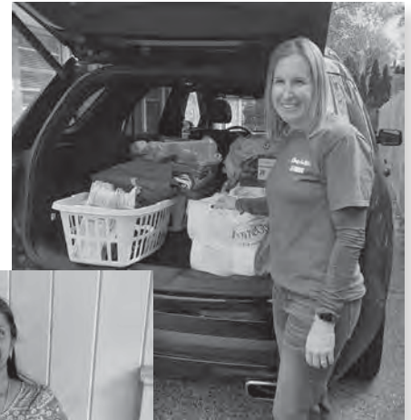
Copeland Manor School staff & students collected shelter supplies