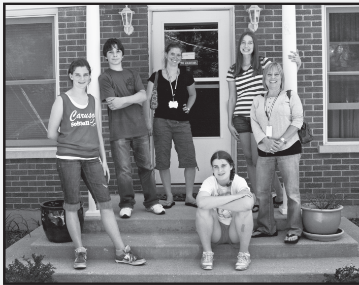
Students from Caruso Middle School donated great items to our shelter.

• The students at LHS have been working hard on our behalf: The Libertyville High School Girls' Lacrosse Team raised money for The Haven with a Bowl-a-Thon, and The Libertyville High School Honor Society conducted a drive and collected and delivered shelter supplies. Also, the Libertyville High School Fret Boarders Music Club raised money on our behalf.