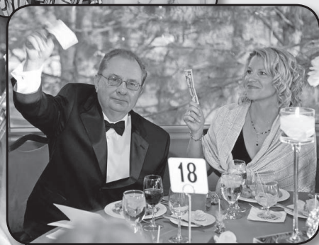
A week in South Carolina, a Ravinia package and a balcony at a Cubs game had bidders at the edge of their seats during the live auction. Their generosity will also help shelter clients to enjoy a new kitchen.