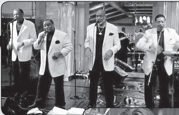
Everybody moved to the rhythm of The Moods.