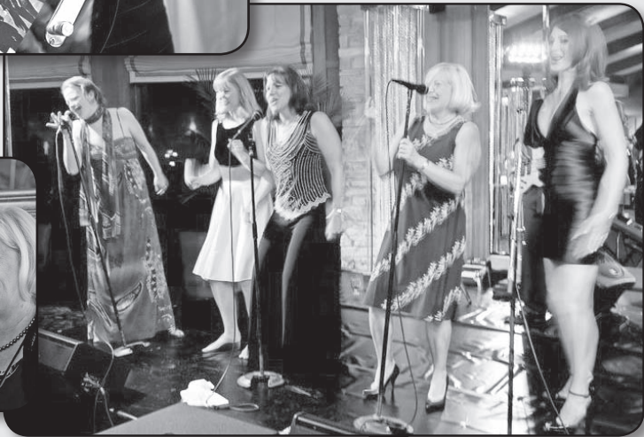
Our talented volunteers on a very different realm: showbiz!